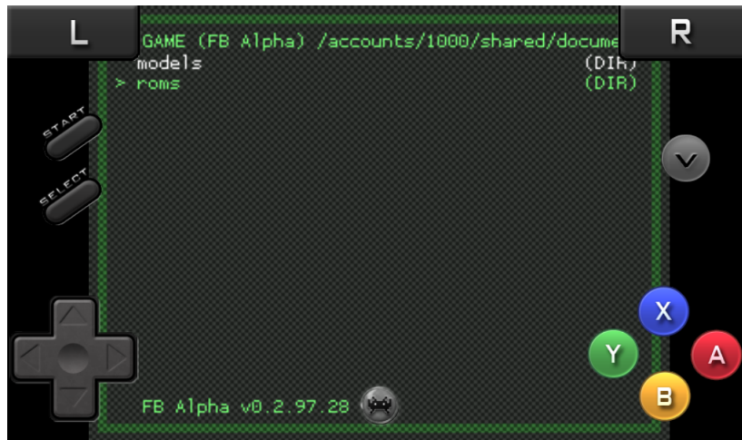
Figure 2: After selecting the core, you will need to load a game.