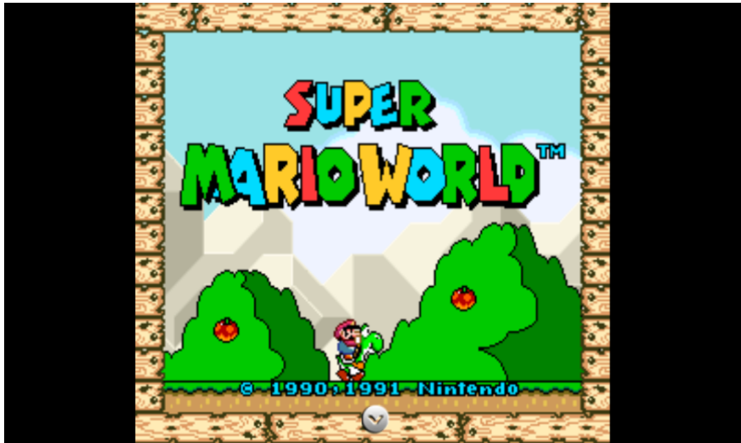
Figure 5: 'Gameplay' screen.