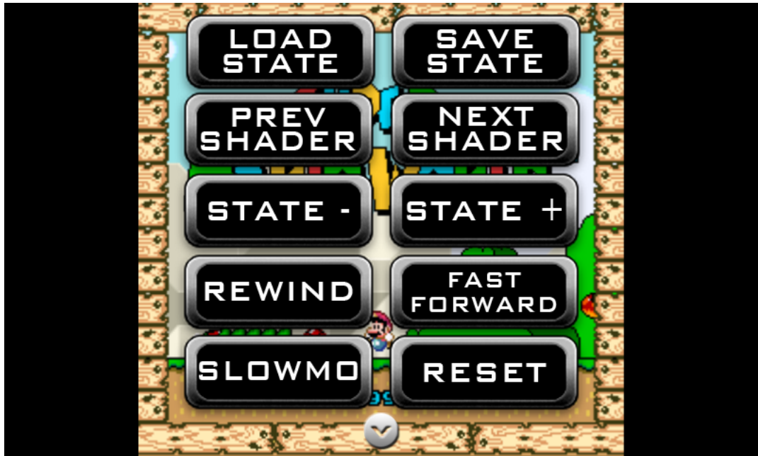
Figure 4: 'Quick Menu' screen.