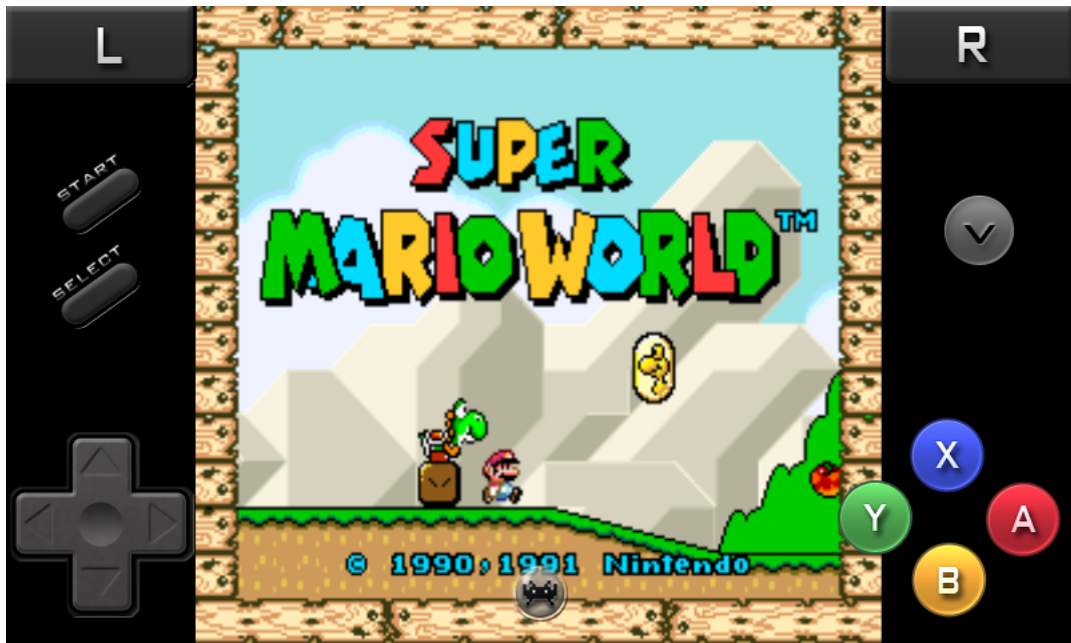
Figure 3: 'RetroPad overlay' screen.

will take you to the first slide again and the cycle will continue from there.